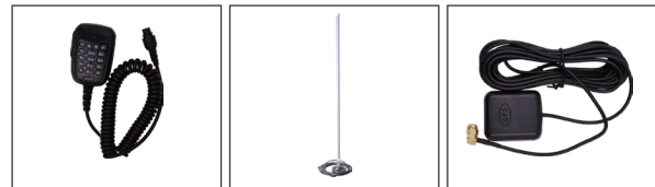
Hand Microphone (with keypad)